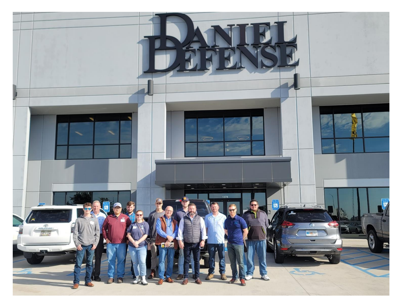
January Meeting – Tour of Daniel Defense