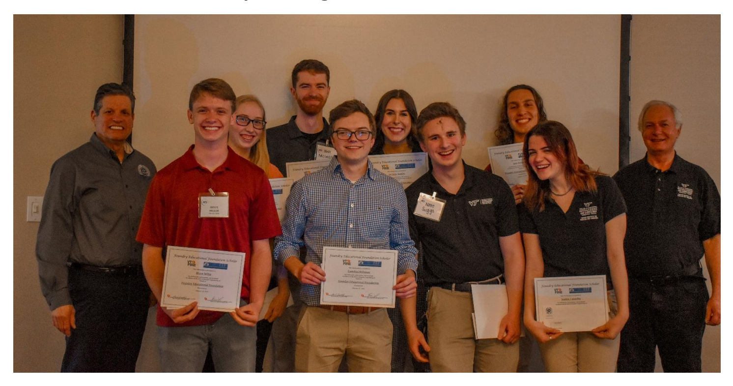
February Meeting – Virginia Tech