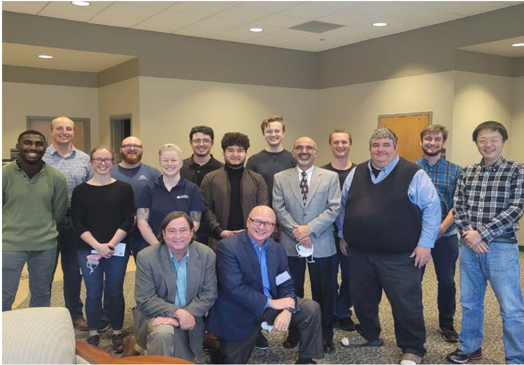
Southern CORE Scholarship Recipients

After our January program in Savannah, we traveled to Statesboro to tour the Engineering Labs and the Southern CORE Foundry. There continues to be substantial progress in developing this facility. The new Wheelabrator shot blast has been relocated and is hoped to be installed soon. Thank you Wheelabrator for your continuation of support to foundry education.