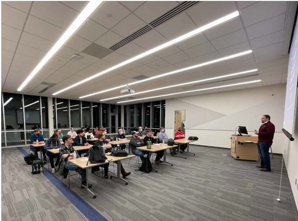
AFS Cast Iron Research Committee presentation to GSU Students

On Jan 25-26, the AFS Cast Iron Research Committee visited Georgia Southern and held their meeting on campus. The committee also gave a series of presentations of 20 GSU students. What a wonderful opportunity for this important research committee to engage with our students.