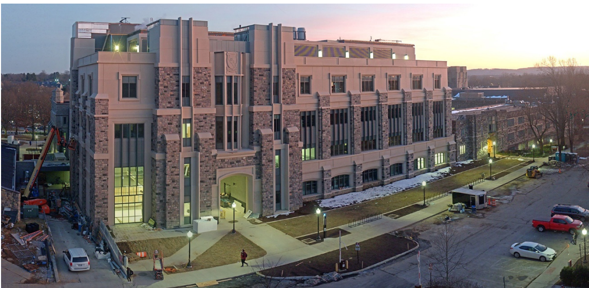
Holden Hall February 2022

We are counting down the weeks until our planned “move in” date of March. It is hard to believe this project has remained relatively on time during this era of covid. Congratulations to our MSE Department employees and the construction team at Va Tech on making the new Holden Hall a reality.