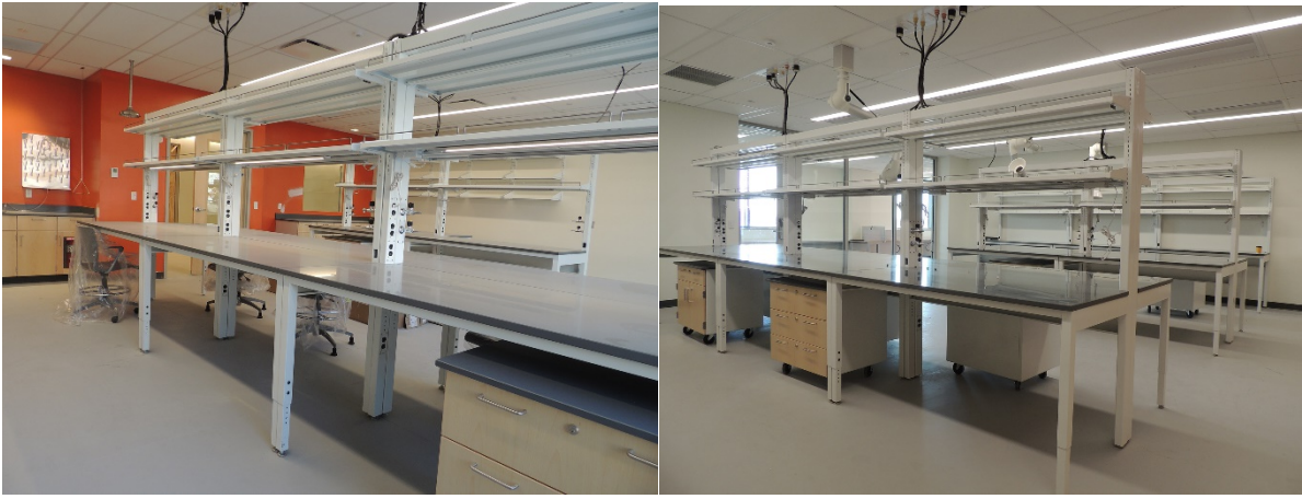
Internal Labs under construction

We have also started the virtual interview process in hiring our new Department Chair. After this process is complete the COE will be hosting on-site interviews for this extremely important hire.