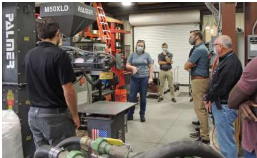
Friday Tour of VT Fire