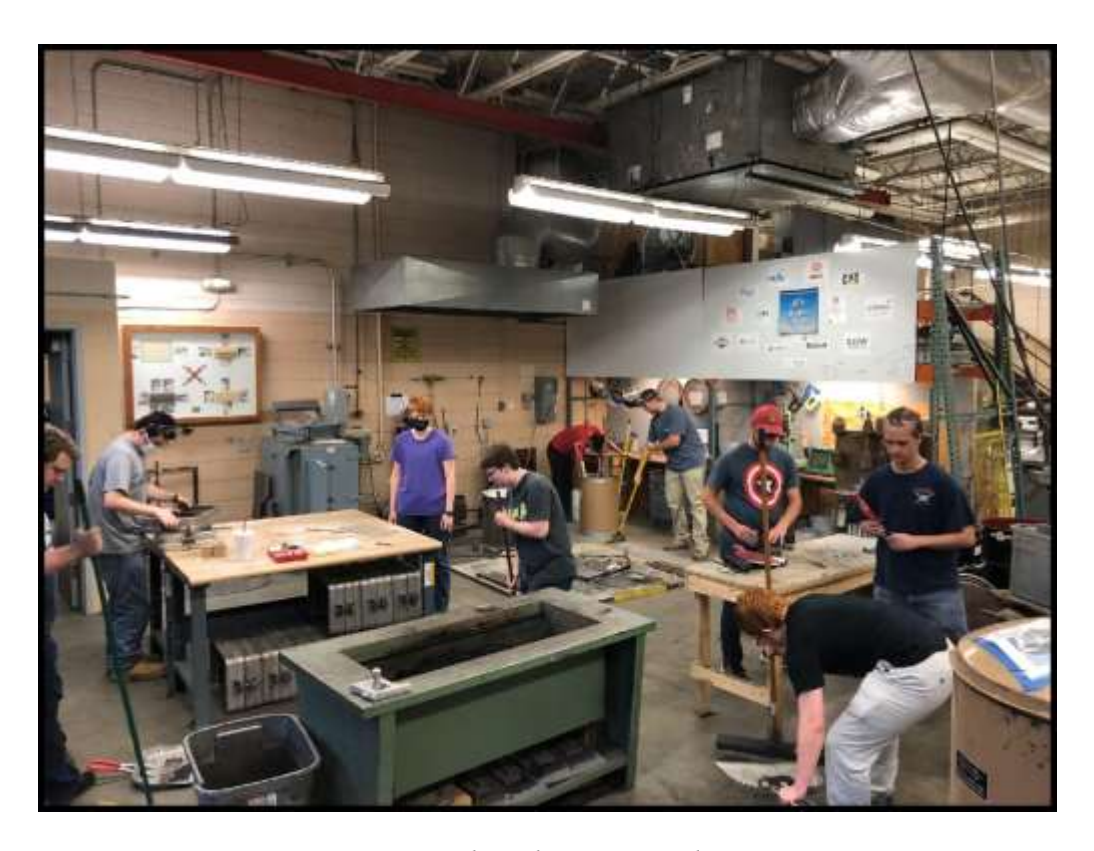
Foundry Clean-Up Underway!

The Southern CORE students have also undertaken an intensive foundry clean-up effort. A group of 14 students met to clean and organize the foundry.