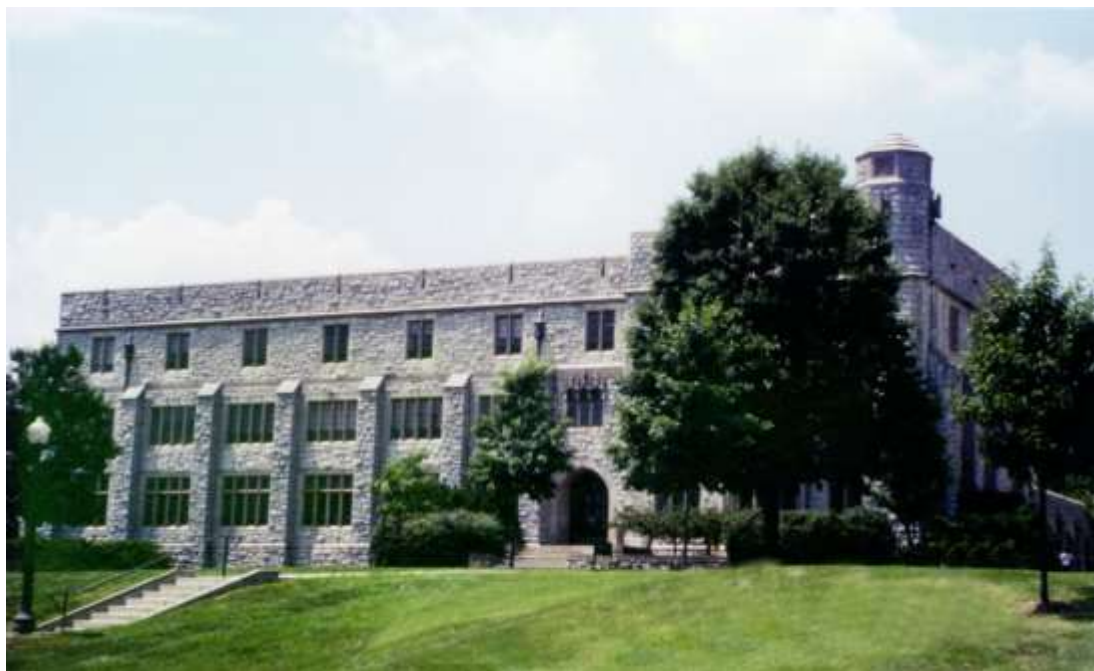
Holden Hall Before Start of Renovations

Holden Hall's renovation continues full steam ahead. A few walls are up and the scope of the expansion is now very apparent.