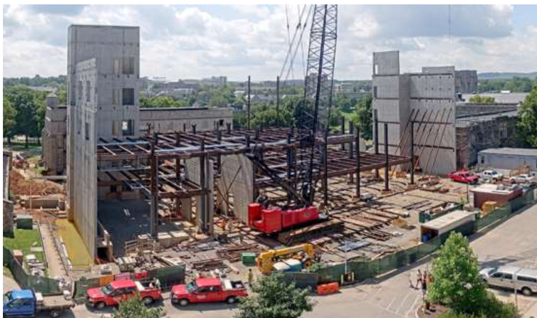
Holden Hall Undergoing Renovations