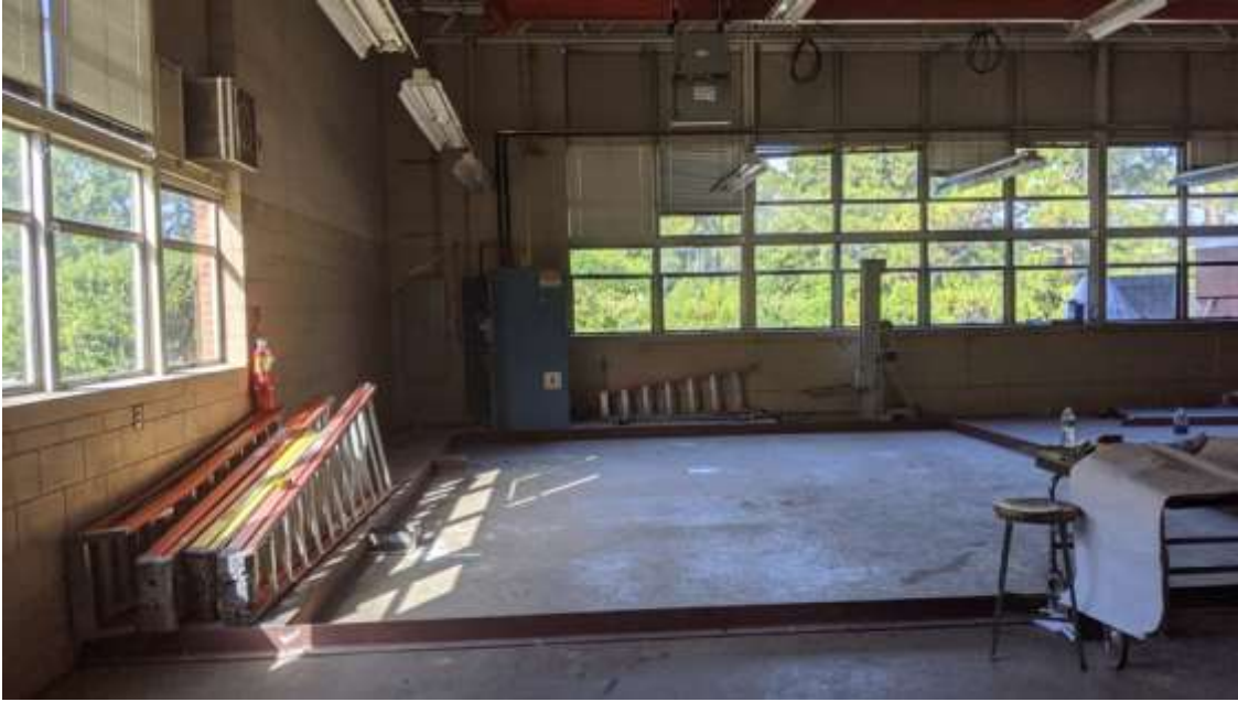
Southern CORE Foundry Lab Construction