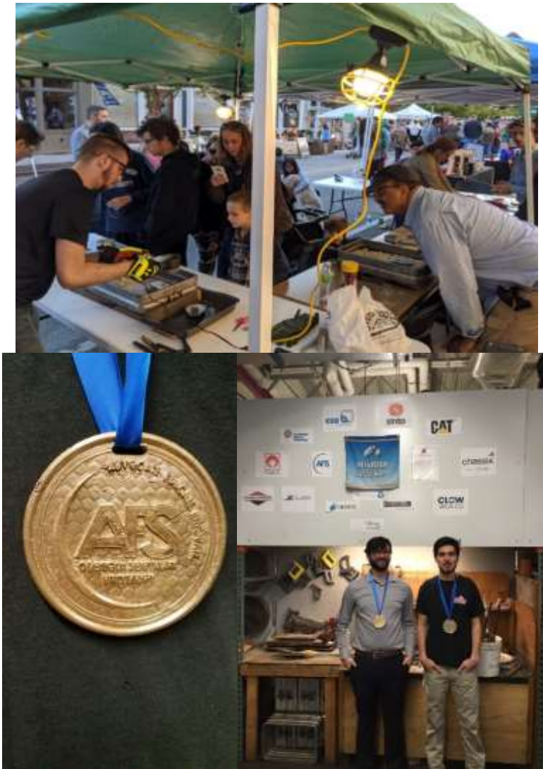
(L) Southern CORE students demonstrating the casting process. (R) Students show off their cast medallions which was used for the departments graduation seniors.

Their students are in the beginning stages of the Bowie Knife Cast in Steel competition hosted by the Steel Founders' Society and are competing in this year's SE Regional competition hosted by the AFS Tennessee