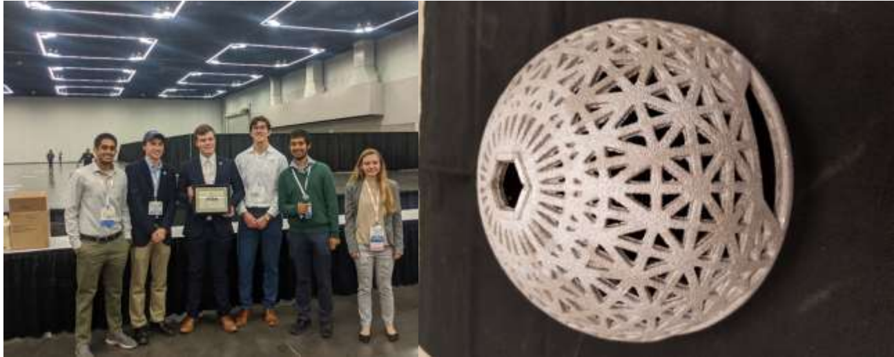
VT FIRE student competitors at the MS&T Domesday Competition and their winning entry.

Our students have also been active in utilizing our Foundry in a Box. We completed our semester Open Foundry day last month with over 250 attendees, pouring 171 scratch molds.