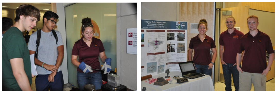
Figure 1 Demo at Virginia Tech